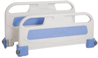
KRAFT 806 ● P.P HEAD & LEG BOWS (EXCEL PLUS) approx wt: 9.200 kgs per set