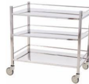
KRAFT 604 INSTRUMENT TROLLEY - S.S Available in various sizes