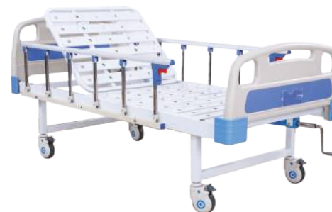
KRAFT 143 MANUAL SEMI FOWLER BACKREST BED 1 FUNCTION (ECONOMY)