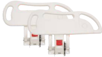
KRAFT 807 ○●●● TUCK AWAY P.P SIDE RAILS (SET OF 4)