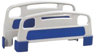
KRAFT 801 ●● P.P HEAD & LEG BOWS (ECONOMY) approx wt: 4.500 kgs per set