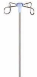
KRAFT 822 I.V ATTACHMENT FOR BED