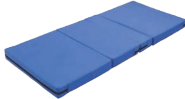
KRAFT 812 (3") / 812 A (4") MULTI FOLD FOAM MATTRESS