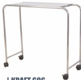
KRAFT 606 OVER BED TABLE - S.S SIZE : L 1115mm X W 445mm X H 965mm