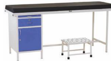
KRAFT 203 SIMPLE EXAMINATION COUCH SIZE : L 1830mm X W 575mm X H 850mm