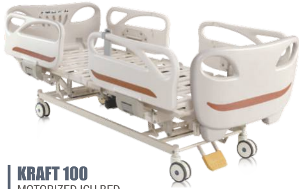
KRAFT 100 MOTORIZED ICU BED 5 FUNCTION (EXCEL PLUS)