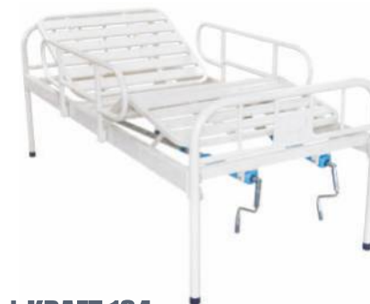
KRAFT 134 MANUAL FOWLER BED 2 FUNCTION (CLASSIC)