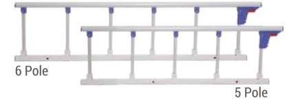
KRAFT 810 (6 Pole) / 810 A (5 Pole) ALUMINIUM COLLAPSIBLE SIDE RAILS (SET OF 2)