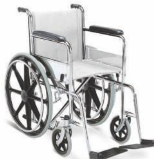
KRAFT 704 NON FOLDING WHEEL CHAIR S.S