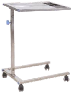
KRAFT 605 MAYO'S TROLLEY - S.S SIZE : L 560mm X W 445mm X H 810 to 1270mm