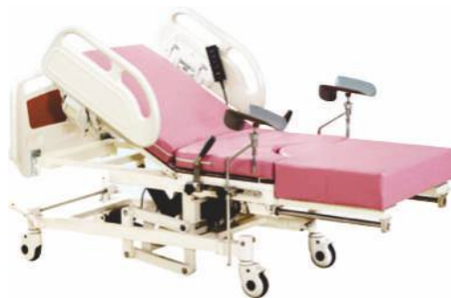
KRAFT 301 MOTORIZED OBSTETRIC LABOR & RECOVERY BED - 3 FUNCTION