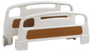
KRAFT 802 ●● P.P HEAD & LEG BOWS (DELUXE) approx wt: 6.500 kgs per set