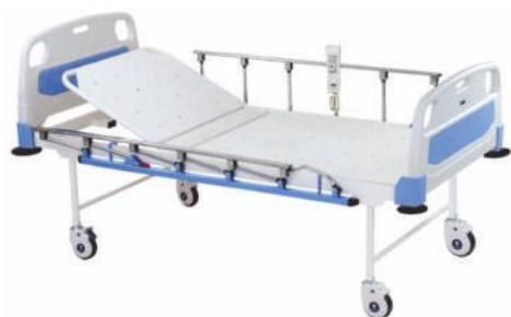
KRAFT 141 MOTORIZED SEMI FOWLER BACKREST BED 1 FUNCTION (PREMIUM)