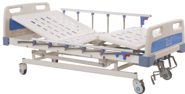
KRAFT 103 MANUAL ICU BED 5 FUNCTION (DELUXE)