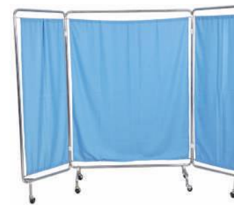
KRAFT 705 BED SIDE SCREEN S.S / M.S SIZE : H 1675mm X W 2440mm