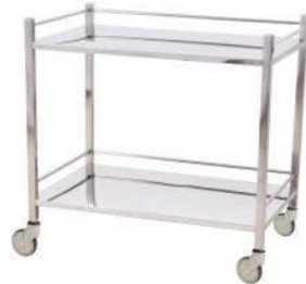
KRAFT 602 INSTRUMENT TROLLEY - S.S Available in various sizes