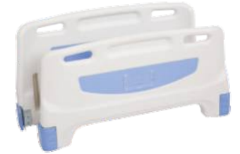
KRAFT 805 ● P.P HEAD & LEG BOWS (EXCEL) approx wt: 9.000 kgs per set