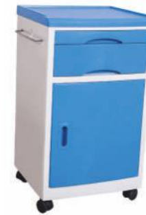
KRAFT 702 BED SIDE LOCKER ABS SIZE : L 445mm X W 415mm X H 770mm