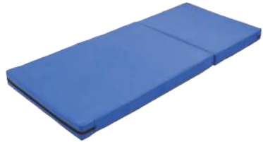
KRAFT 811 (3") / 811 A (4") SINGLE FOLD FOAM MATTRESS