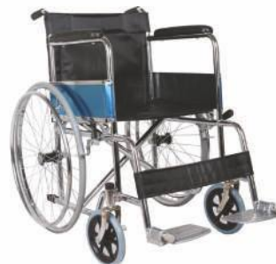
KRAFT 704 A FOLDING WHEEL CHAIR