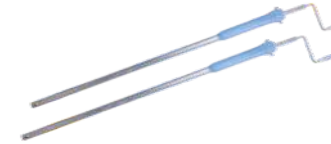
KRAFT 814 BED CRANK - 48"