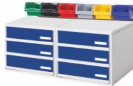
KRAFT 813 CRASH CART ACCESSORIES 2 CABINET & 6 UTILITY BINS