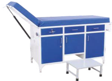
KRAFT 202 EXAMINATION COUCH WITH BACKREST SIZE : L 1830mm X W 575 mm X H 850mm