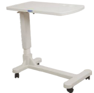
KRAFT 703 A ○ ● ADJUSTABLE BED SIDE TABLE GAS SPRING