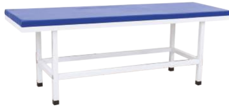
KRAFT 152 ATTENDANT BED SIZE : L 1830mm X W 610mm X H 380mm