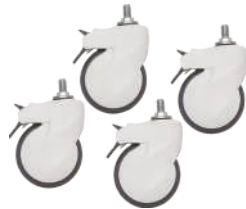
KRAFT 818 HEAVY CASTORS 125MM