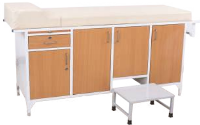
KRAFT 201 EXAMINATION COUCH SIZE : L 1830mm X W 575 mm X H 850mm