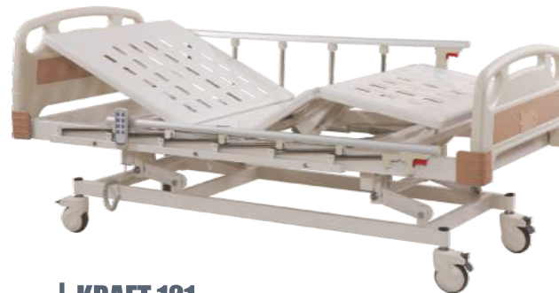
KRAFT 121 MOTORIZED ICU BED 3 FUNCTION (PREMIUM)