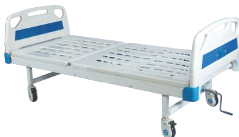
KRAFT 142 MANUAL SEMI FOWLER BACKREST BED 1 FUNCTION (DELUXE)