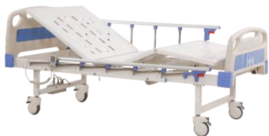
KRAFT 131 MOTORIZED FOWLER BED 2 FUNCTION (PREMIUM)