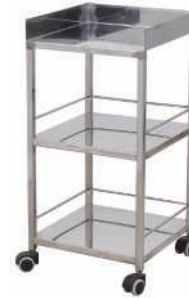
KRAFT 603 BED SIDE TROLLEY - S.S Available in various sizes