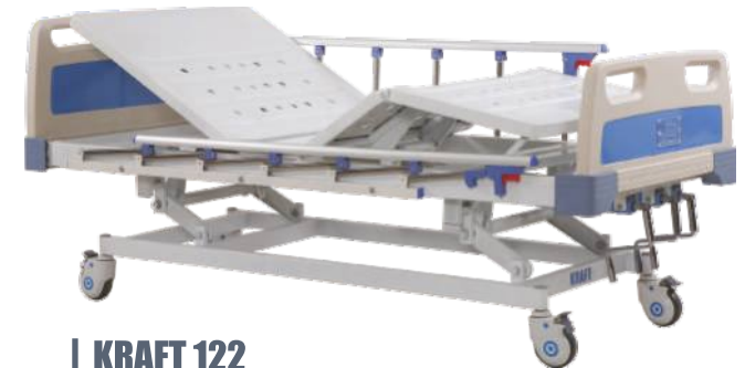
KRAFT 122 MANUAL ICU BED 3 FUNCTION (DELUXE)