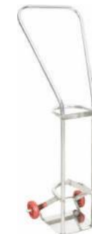
KRAFT 706 CYLINDER TROLLEY S.S / M.S 10 LTRS