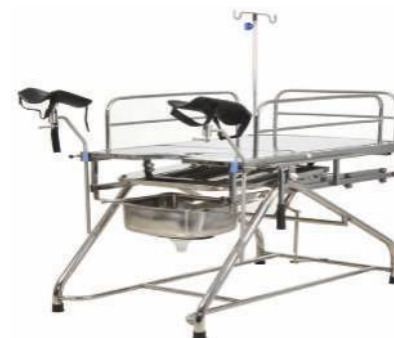
KRAFT 302 TELESCOPIC OBSTETRIC & GYNAEC TABLE - S.S. SIZE : L 1830mm X W 760 mm X H 760mm