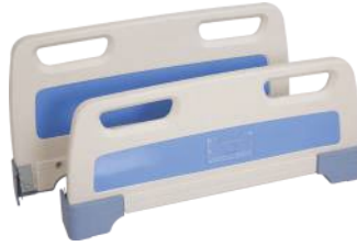
KRAFT 803 ● P.P HEAD & LEG BOWS (DELUXE PLUS) approx wt: 6.500 kgs per set