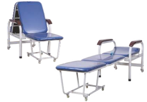
KRAFT 154 ATTENDANT BED CUM CHAIR