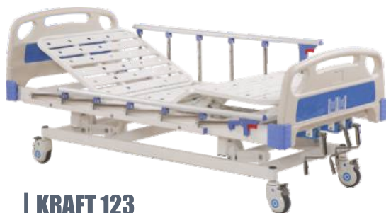
KRAFT 123 MANUAL ICU BED 3 FUNCTION (ECONOMY)