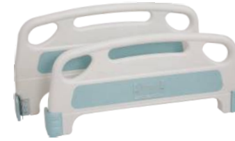
KRAFT 804 ●●● P.P HEAD & LEG BOWS (PREMIUM) approx wt: 7.100 kgs per set