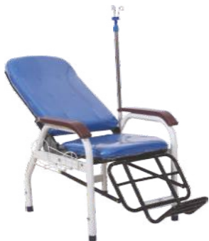
KRAFT 205 BLOOD DONATION COUCH