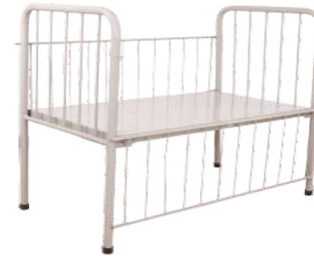
KRAFT 153 PEDIATRIC BED CLASSIC SIZE : L 1370mm X W 625mm X H 560mm