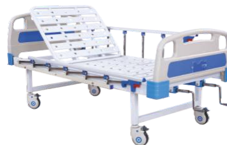
KRAFT 133 MANUAL FOWLER BED 2 FUNCTION (ECONOMY)