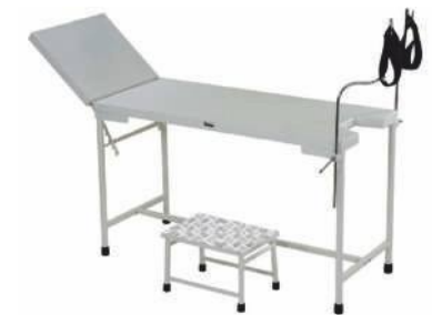
KRAFT 303 SIMPLE GYNAEC DELIVERY TABLE S.S./M.S. SIZE : L 1830mm X W 760mm X H 760mm