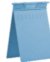
KRAFT 820 ABS CHART HOLDER