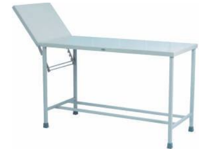
KRAFT 204 EXAMINATION TABLE S.S. SIZE : L 1830mm X W 537mm X H 810mm