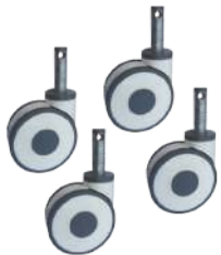
KRAFT 816 CENTRAL LOCKING CASTORS 125MM