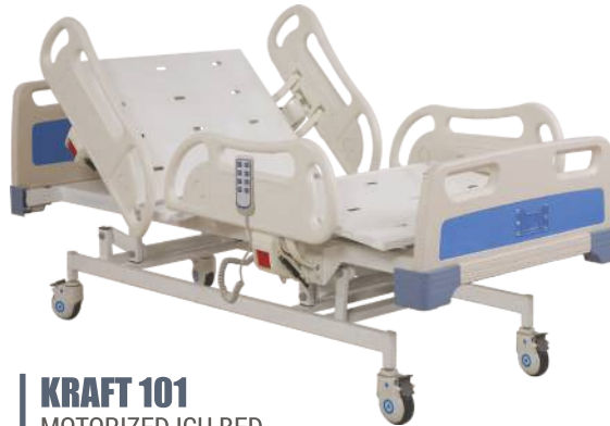
KRAFT 101 MOTORIZED ICU BED 5 FUNCTION (EXCEL)