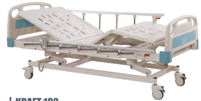
KRAFT 102 MOTORIZED ICU BED 5 FUNCTION (PREMIUM)