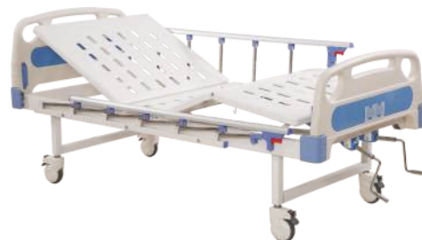
KRAFT 132 MANUAL FOWLER BED 2 FUNCTION (DELUXE)