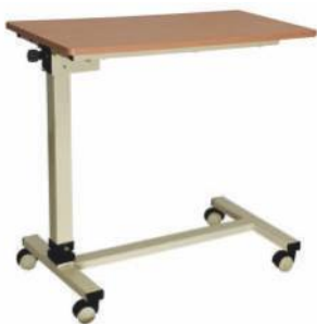
KRAFT 703 B ADJUSTABLE BED SIDE TABLE WITH KNOB