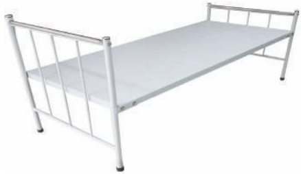
KRAFT 151 PLAIN BED CLASSIC SIZE : L 1900mm X W 900 mm X H 560mm