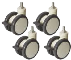
KRAFT 817 TWIN CASTORS 125MM