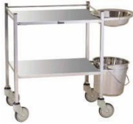
KRAFT 601 DRESSING TROLLEY Available in various sizes