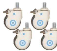
KRAFT 819 ECONOMY CASTORS 125MM