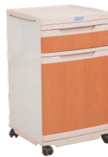
KRAFT 701 BED SIDE LOCKER ABS (DELUXE) SIZE : L 460mm X W 450mm X H 820mm