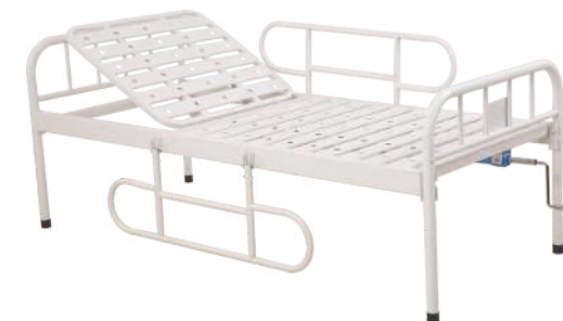
KRAFT 144 MANUAL SEMI FOWLER BACKREST BED 1 FUNCTION (CLASSIC)